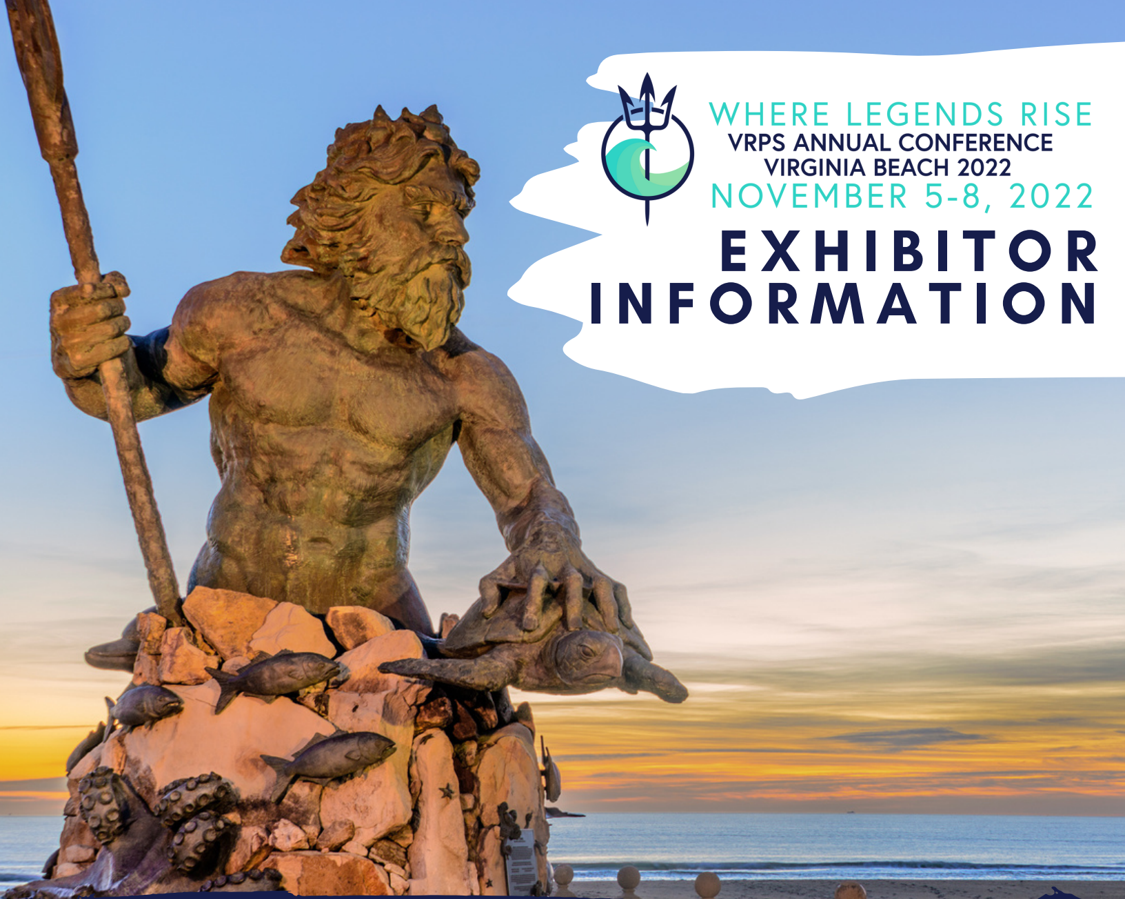
EXHIBIT HALL | MONDAY, NOVEMBER 7